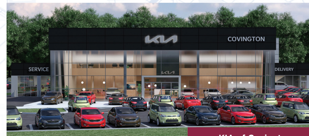
KIA of Covington